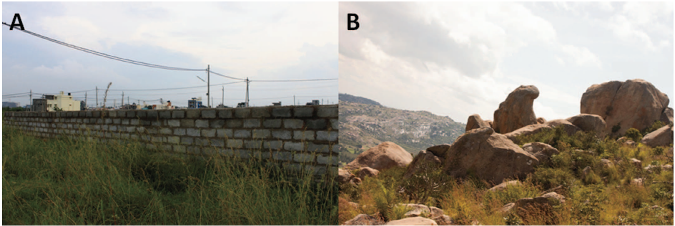
FIG. 1. Example of sampling sites in (A) urban and (B) rural habitats in and around Bangalore, India.